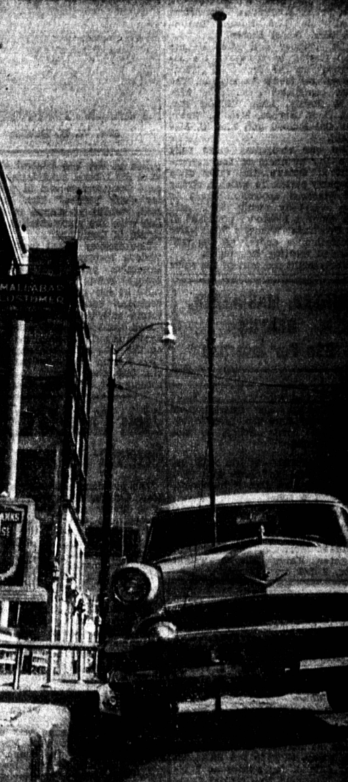
This late-model car was impaled to the pavement in downtown Winnipeg by a steel TV aerial that was snapped from atop a four-storey building by a 70-mile-an-hour wind and plunged to the street. It went through the engine hood, missing the engine. The car was parked and vacant.