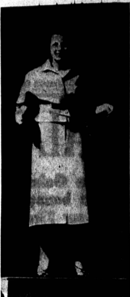
MRS. CALVIN MUNROE

Spinach and bacon salad: 3 qts. raw spinach, 3 hard-boiled eggs chopped, 8 slices cooked bacon crumbled. Break the spinach in