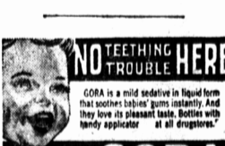
NO TEETHING TROUBLE HERE USE GORA

Work gloves and oily rags, so much in evidence this time of year, can be inexpensively cleaned in two gallons of warm water and one tablespoon of washing soda. Let soak for a while, then wash in the usual way.