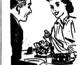
SOFT MOLASSES COOKIES

1 c. sugar 1 c. molasses 1 c. shortening (softened quite a bit) 1 egg 2/3 c. of hot water 4 tsp. soda (level) in the hot water 1 tsp. cream tartar 1/2 tsp. salt 2 tsp. ginger 4 1/2 c. of flour (no more)