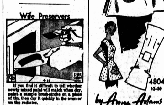
4804 12-20 by Anne Adams

Send order to ANNE ADAMS, c/o The Guardian, 60 Front Street West, Toronto.