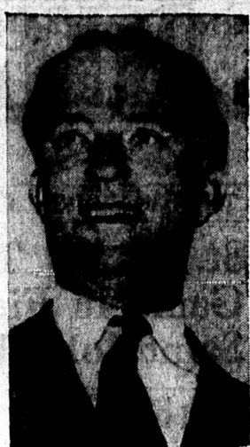
AWAITS ELECTION — King Leopold of Belgium will soon learn whether the Belgians want him to return from exile to the throne he surrendered during World War II.