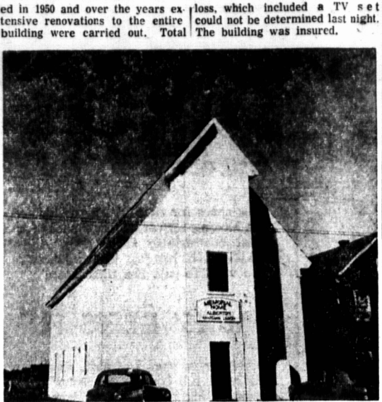
THE ALBERTON LEGION HOME

The Legion Home was purchased in 1950 and over the years extensive renovations to the entire building were carried out. Total loss, which included a TV set could not be determined last night. The building was insured.