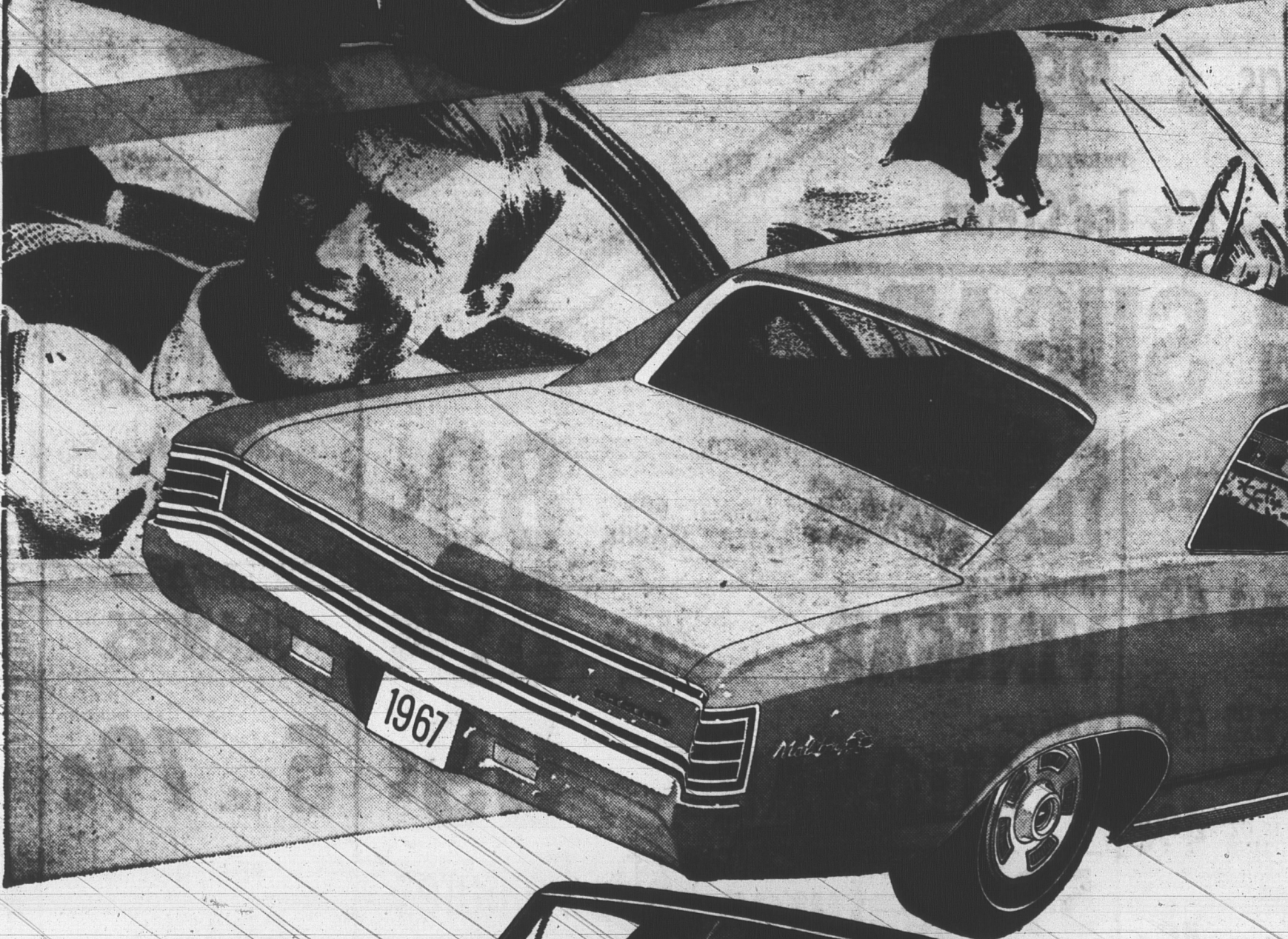
Chevelle Malibu Sport Coupe with the Sports Option and 396-cu.-in. V8

Corvair belongs to the smart set with internationally acclaimed styling. Your membership comes with North America's only air-cooled rear-engined fun car. And '67 Corvair has all the best features of sports cars — plus all the spaciousness of family cars. In two series: Monza or 500 models. Join the smart set with a brand new '67 Corvair from your Chevrolet dealer's.