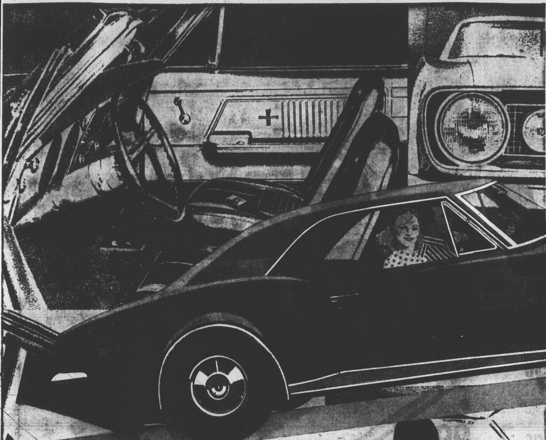
SS 350 Camaro Sport Coupe with Rally Sport Option

— the four-place driving machine from Chevrolet that's as new as now. With elliptical body styling. You build it the way you want. In three basic versions: the Camaro; The Rally Sport Camaro with hideaway headlights; and the big, bold SS 350 Camaro, a car of a different stripe. Power runs up to the SS 350's exclusive new 295-hp V8. Round dial instruments, bucket seats, Chevrolet's safety features — all standard. Add four-on-the-floor, disc brakes and take off from your Chevrolet dealer's for sporty action.