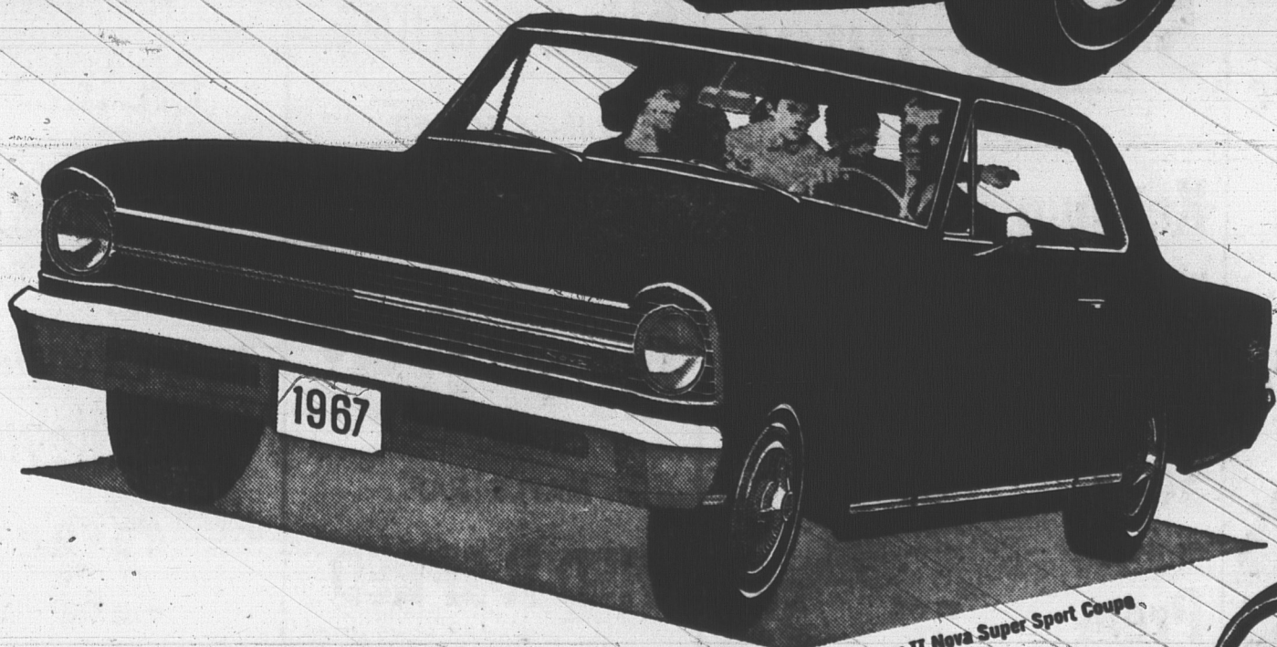
Chevy II Nova Super Sport Coupe