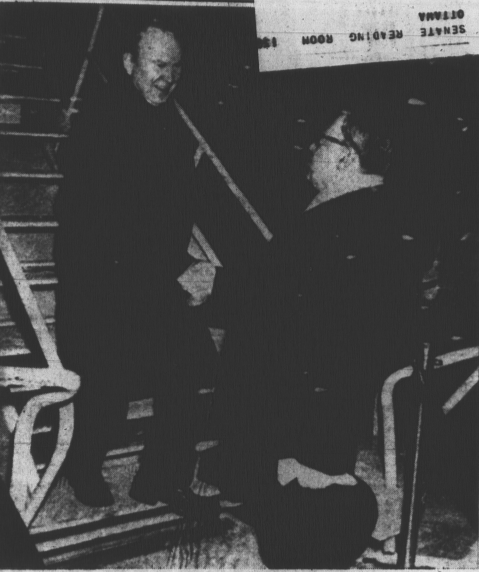
BACK IN THE COLD

Prime Minister Pearson (LEFT) is welcomed back to snow-cold Canada by External Affairs Minister Martin at Ottawa's Uplands Airport Thursday night. The Prime Minister returned from a six-day trip to Lagos, Nigeria, where he attended a Commonwealth meeting on the Rhodesian question. Mr. Martin was acting prime minister during Mr. Pearson's absence.