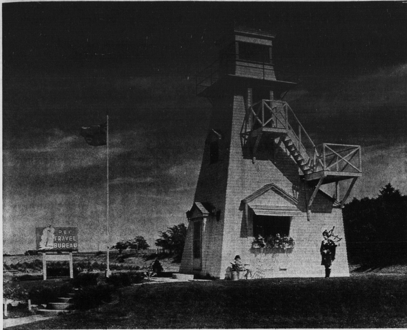
THE TOURIST INFORMATION CENTER AT ALBANY IS ONE OF SEVERAL STAFFED BY THE P.E.I. TRAVEL BUREAU