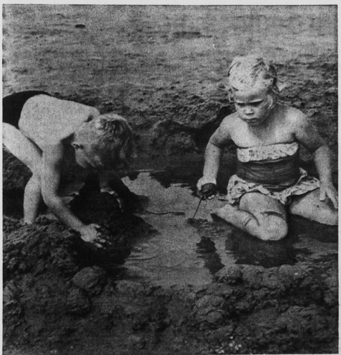
ISLAND BEACHES ARE A GIANT SANDBOX . . .