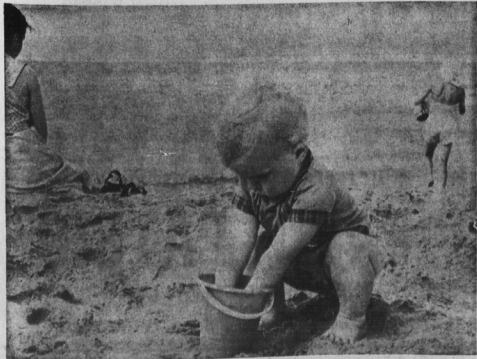
... FOR THE YOUNGER SET WHILE MOM AND DAD SWIM