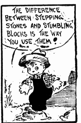
THE DIFFERENCE BETWEEN STEPPING STONES AND STUMBLING BLOCKS IS THE WAY YOU USE THEM!