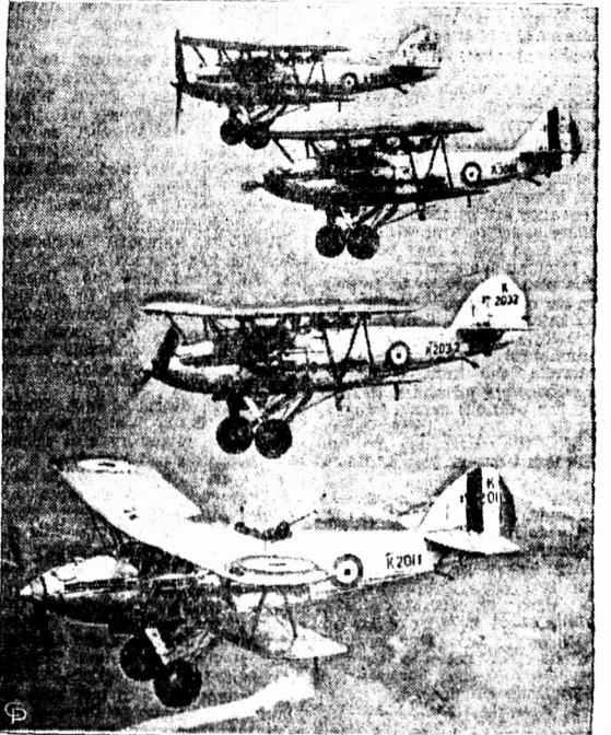
England is trying to make the passage air-minded. Arrangements in this picture a squadron of fighters is shown in formation over Salisbury.