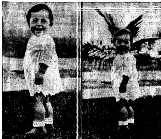
The young lady on the right seems to have sprouted wings, or is she about to be seized by birds of prey? These pictures illustrate the importance of observing backgrounds before you shoot.

SOMETIMES we amateur photographers, in trying to catch outdoor "off-guard" pictures of our friends, especially of children, take too little thought of the picture's background. We rush to the most convenient "shooting" point, take a haphazard aim and pull the trigger, as it were, much as if we feared being actually shot ourselves if we did not act quickly.