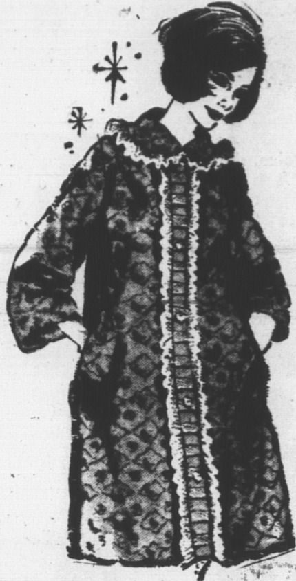
Lovely Quilted Nylon Duster

A treasure-Trove of Lingerie Gifts to Delight Her on Christmas Morn!