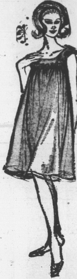
Fantasia Gown by Kayser

So graceful, so delicate, so femininely you! Lovely, lovely embroidery and deep scallops trim the neckline. Cap-sleeve gown. Sheer chiffon overlay is edged at hemline with enchanting contrasting folds of nylon sheer. In shell pink. Sizes S, M, L.