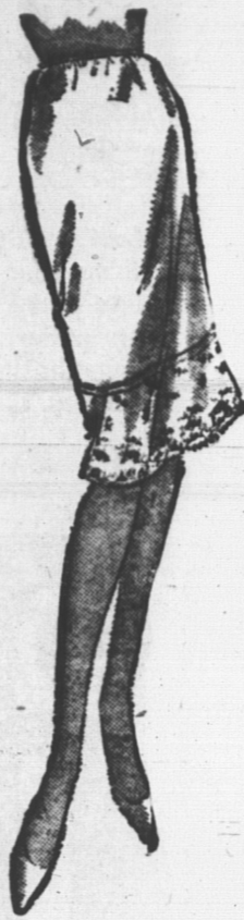
Half Slips by Kayser

Alluring loveliness by this famous maker, "Satin Lady". Hem is lavished with exquisite wide band lace in white, café brown, surf blue. Sizes small, medium or large.