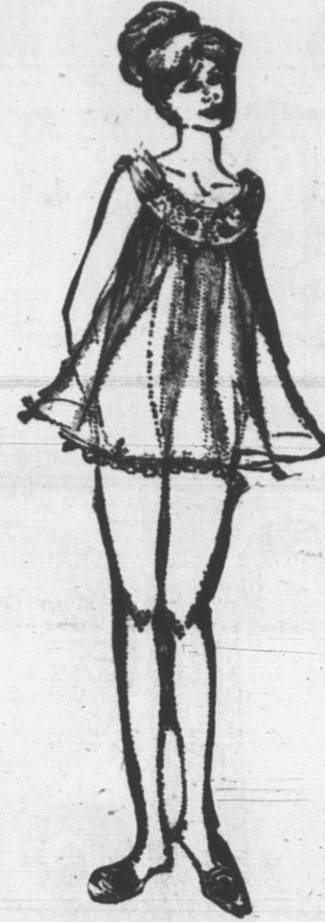
Saucy, Perky Baby Dolls

For free and easy dream-time comfort. Delicate lace trimming on neckline and hems. Soft, glowing shades of pink, blue or flamingo. Sizes small, medium or large.