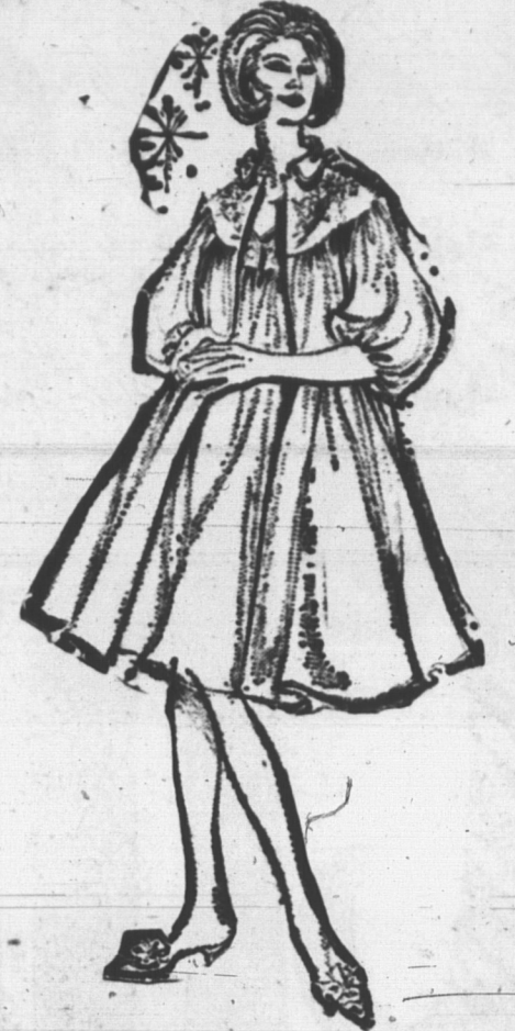
Peignoir Set by Dorsay

Truly a boudoir beauty... dreamy as a honeymoon... it's for you! Nylon 2-pc. set in elegant double nylon chiffon. Lace-lavished on the embroidered neck and hemlines with matching shift gown... so lovely in its own right. In softly sophisticated shades of flamingo, tropic or moonmist. Sizes small, medium or large.