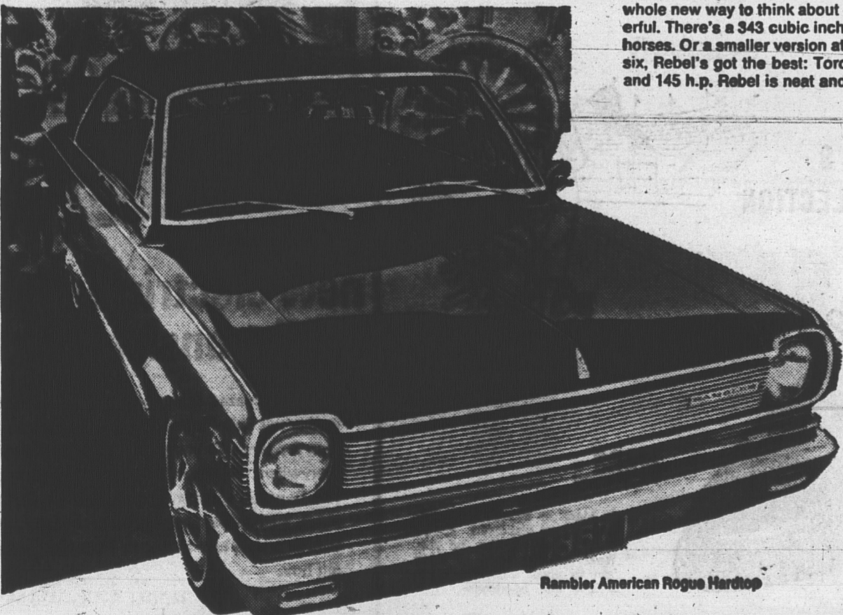
Rambler American Rogue Hardtop

choose, from reclining bucket seats and headrests to 8-track stereo tape player. And Rebel sports a full range of models: sedans, wagons, hardtops, convertibles, including the luxurious SST hardtop and convertible. Drive Rebel — and get a new outlook on driving excitement!