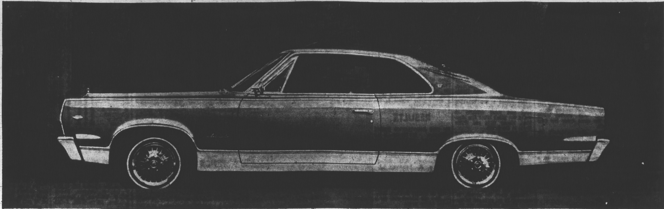
Ambassador DPL Hardtop

WHERE THE BASIC DIFFERENCE IS A BETTER CAR.