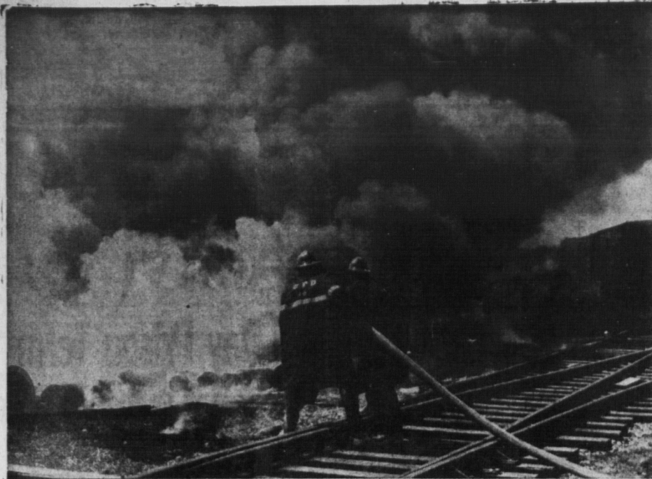
BURNING CREOSOTE TIMBERS CAUSE SMOKE