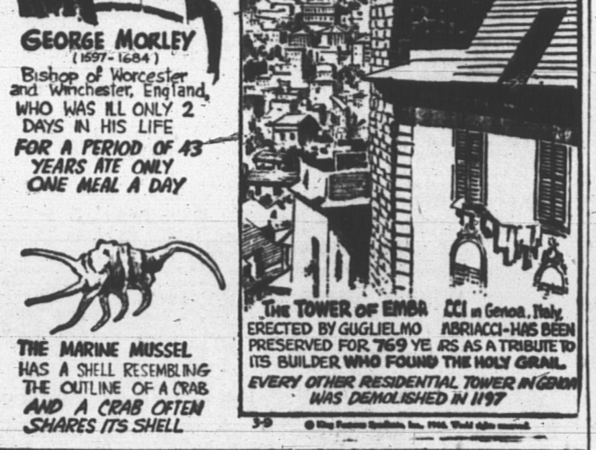
GEORGE MORLEY (1897-1964) Bishop of Worcester and Winchester, England, WHO WAS KILLED ONLY 2 DAYS IN HIS LIFE FOR A PERIOD OF 43 YEARS HE ATE ONLY ONE MEAL A DAY

THE MARINE MUSSEL HAS A SHELL RESEMBLING THE OUTLINE OF A CRAB AND A CRAB OFTEN SHARES ITS SHELL