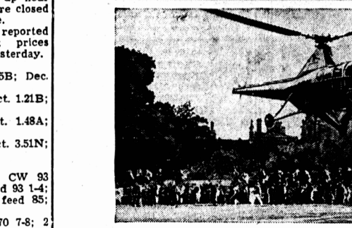
(Above) The helicopter rises from Christ Church Meadow; in the background is Oxford Cathedral. (Below) Undergraduates wave and cheer and a makeshift band plays as the helicopter rises.