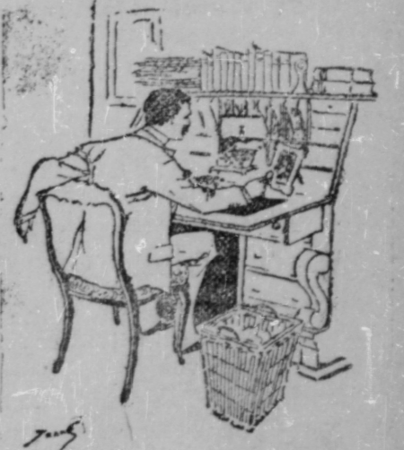
There was not another of its size and color in the world.

It may here be conveniently explained that the gentleman with whom young Ridley had thus fallen into con-