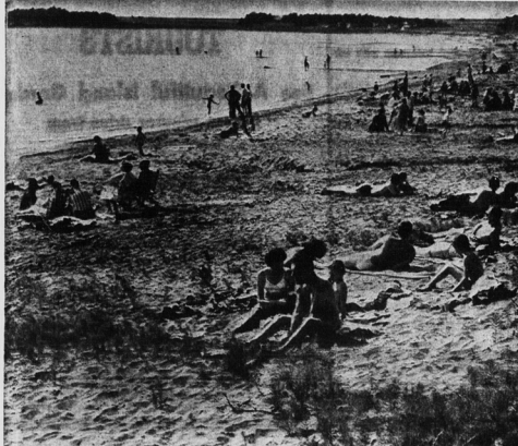
QUELTON BEACH IS ONLY A SHORT DISTANCE FROM USIDE

10 miles from Charlottetown on Route 15 Entertainment Nightly