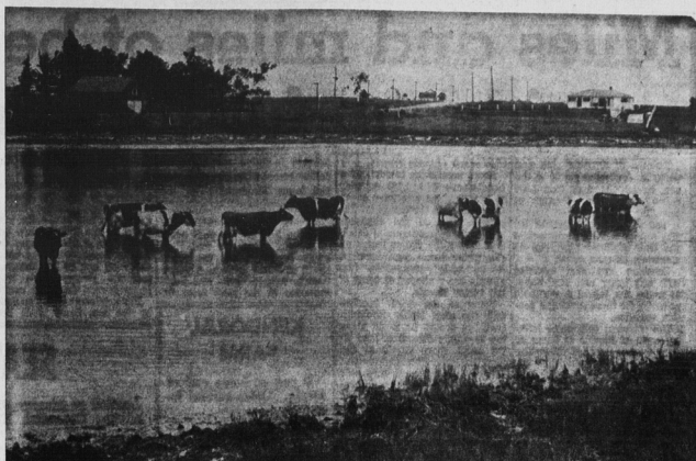
PEACEFUL SCENE AS CATTLE WADE IN WILMOT RIVER

Tree spirits take beating BANGKOK, Thailand (Reuters) - Baldozers and a flood of concrete are driving the tree spirits of Bangkok into the countryside. Old trees which, according to superstitious Thais, harbor good and bad spirits are being cut down to make way for new roads and office blocks. Even the ghosts are leaving because the rambling old mansions which they haunt are being torn down. Belief in ghosts and spirits is still strong in Thailand, a Buddhist Kingdom which until a few decades ago was little touched by Western civilization. The spirits are known as Phi. In quiet corners of Bangkok and in the backwaters of Louis-sprinkled canals, tree spirits are still revered. Certain trees are girded with red and gold bunting behind white-washed fences. On small shrines, candles burn beside offerings of food and flowers.