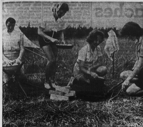
COOL, REFRESHING EVENINGS MAKE CAMPING OUT A PLEASURE