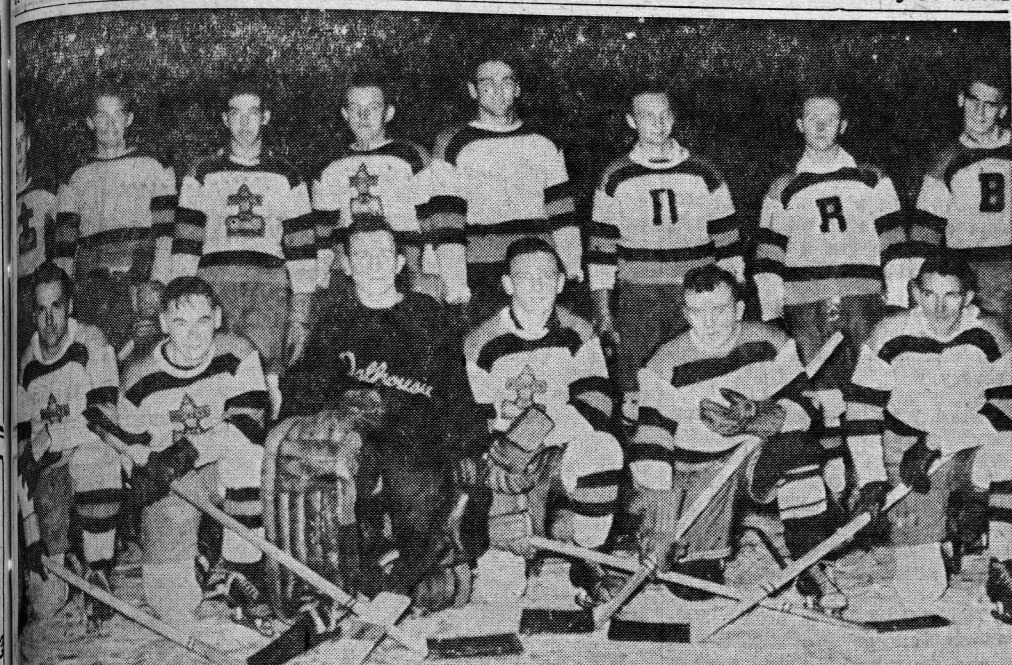
LOSE TO SHERBROOKE