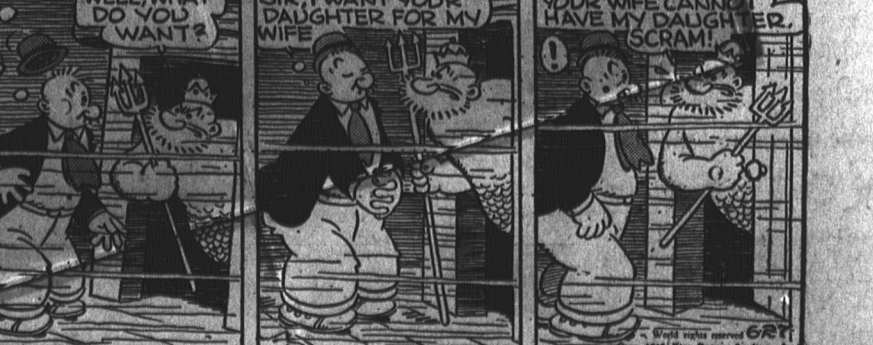
© 1939 King Features Syndicate, Inc.