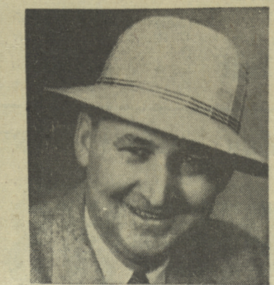
The White Hunter

WE SELL FIRESTONE TOWN AND COUNTRY TIRES