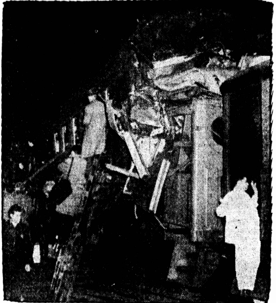
Picture shows the one train riding on top of the other.