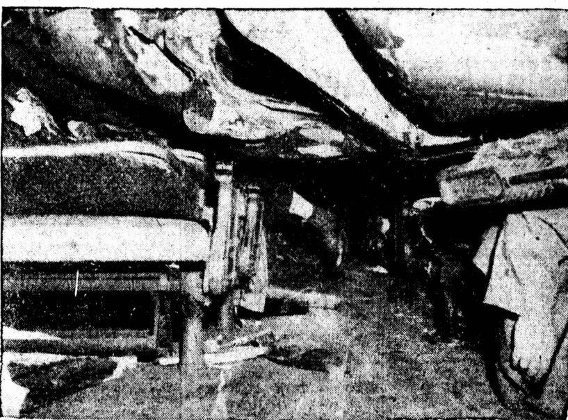
Picture shows the interior of the bottom car.