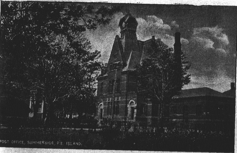
POST OFFICE, SUMMERSIDE, P.E. ISLAND.

Summerside, the second largest town in Prince Edward Island and the capital of Prince County, has grown rapidly since its incorporation in 1875, and enjoys the distinction of being the headquarters of the Canadian National Silver Fox Breeders' Association. From a few scattered houses and one or two stores in 1850 it has grown to its present area with a population of about four thousand.