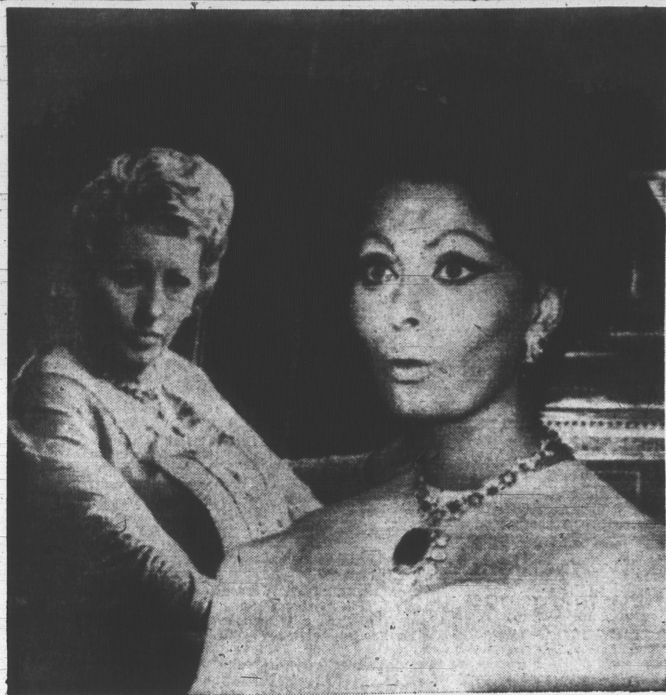
TRY THIS SCREEN TEST

cially its capital expenditures. Although there were "excellent" CBC programs, a good deal were "trivial-tripe." Senator Crerar closed on a note of hope for Canada and the opportunity of the 1967 centennial. "No country in the world can surpass us—not even the U.S." FUR PRICES ROCKET Fur dealers would not pay $1 a skin for muskrat a few years ago but wholesale prices were as high as $3.50 each this year.