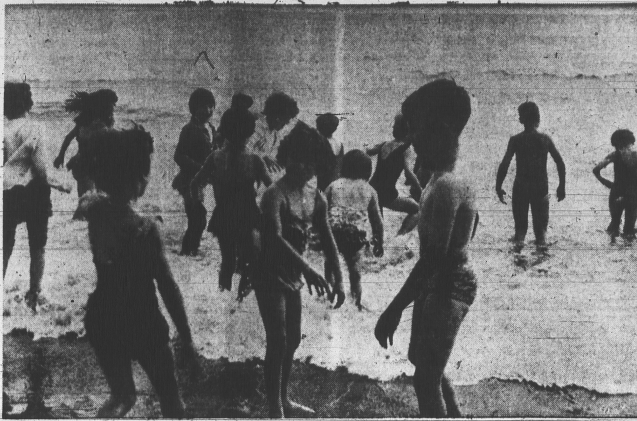
SWIMMING CLASSES OPEN TO ALL CHILDREN