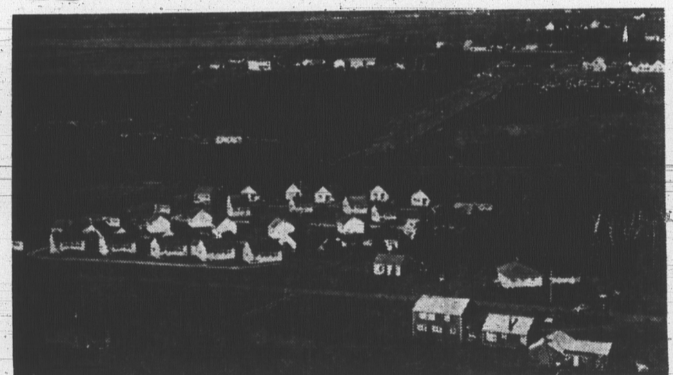
CAVENDISH RESORT AREA