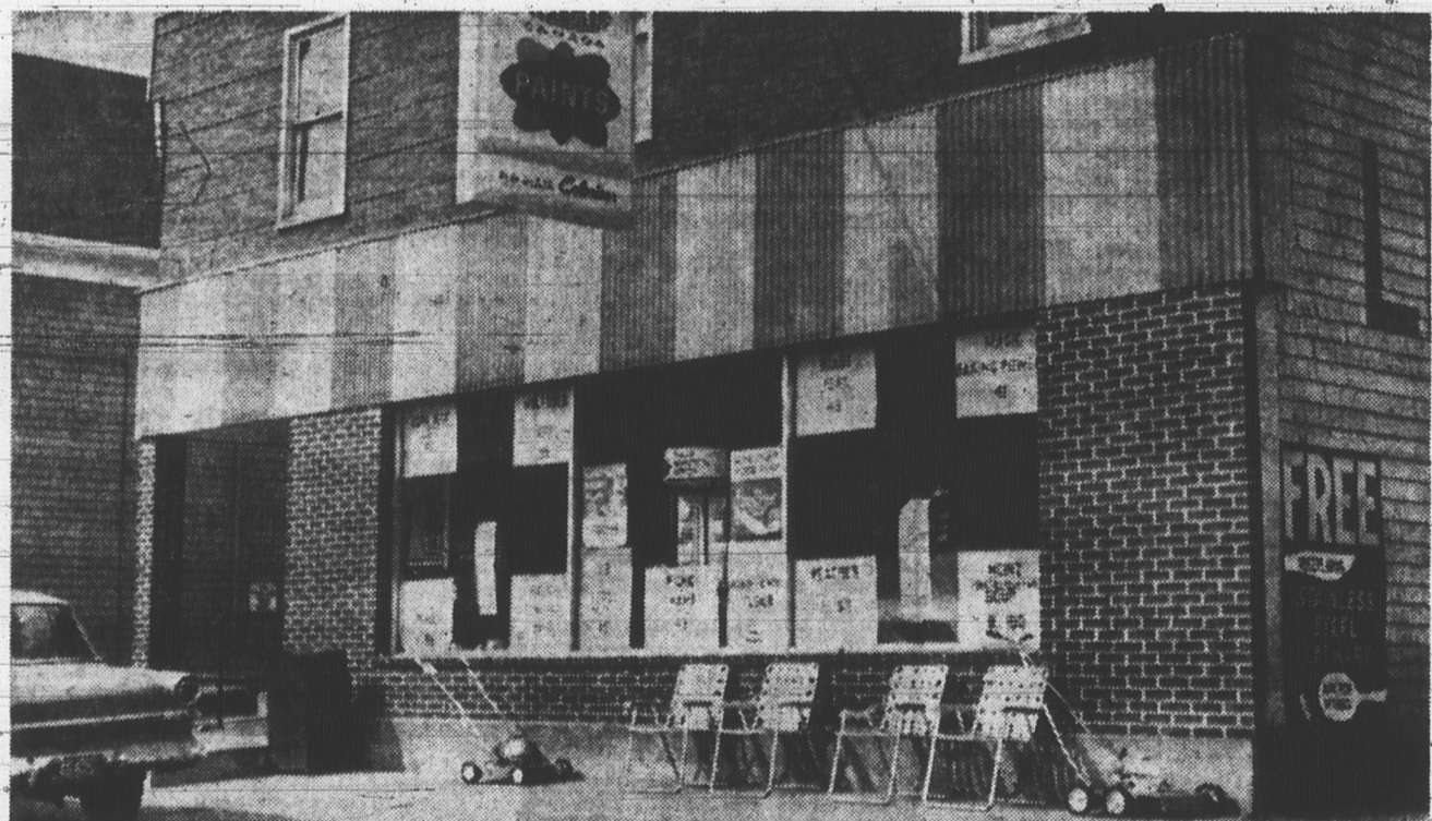
Llewellyn's Newly Enlarged Food Market