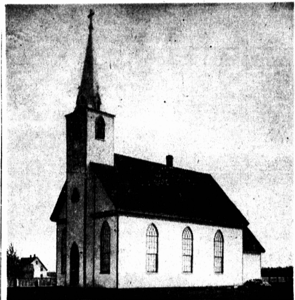
St. Mark's Church, Lot 7, renovated in 1952