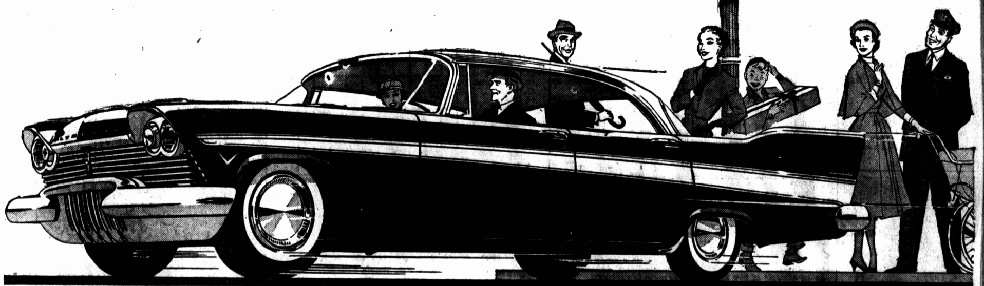
Plymouth Belvedere 4-door hardtop

Puts you in the limelight at every stop light