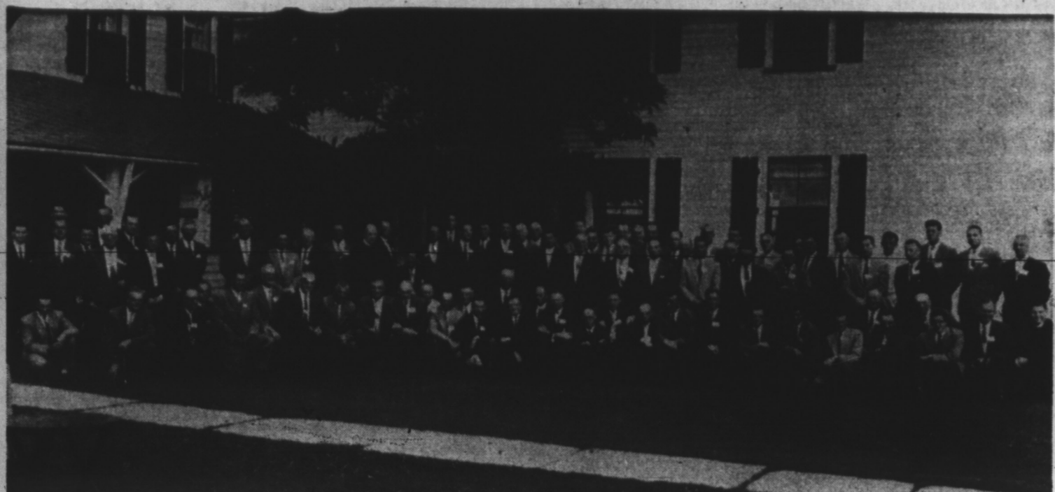
UNITED CHURCH LAYMEN AT STANHOPE