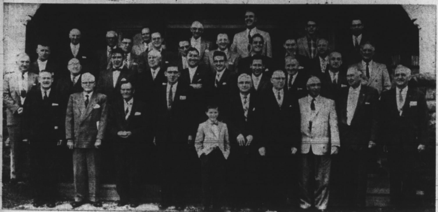
ARTIST LAYMEN MEET AT DALVAY