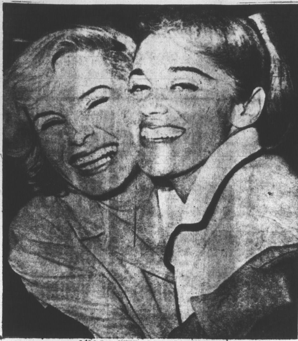
HUGS HER ATTORNEY

Palmer Electric Ltd. Fitzroy St. Dial 4-8545