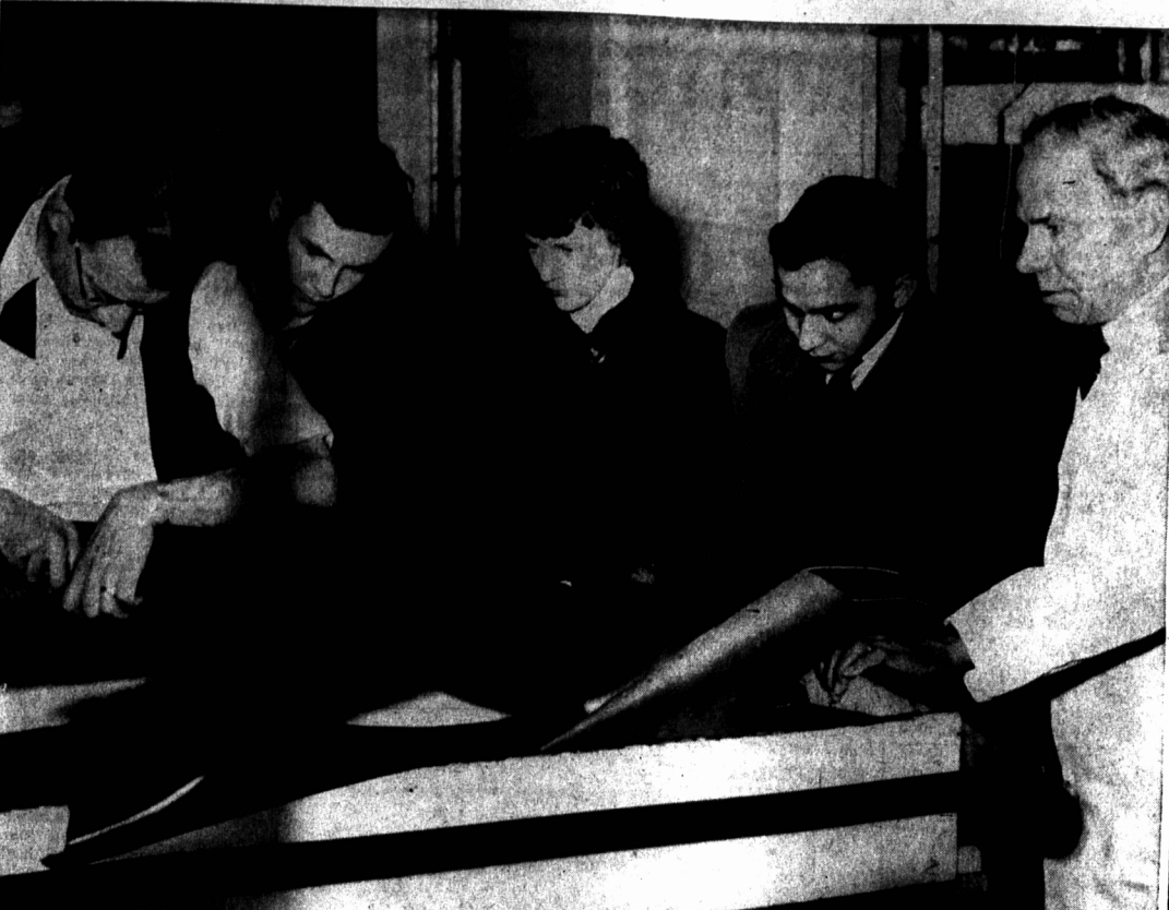
Charlottetown Student Visits Somerset Shoe Factory