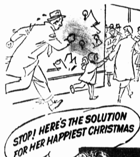
STOP! HERE'S THE SOLUTION FOR HER HAPPIEST CHRISTMAS

The first reindeer in Alaska, were brought in from Russia in the 19th century.