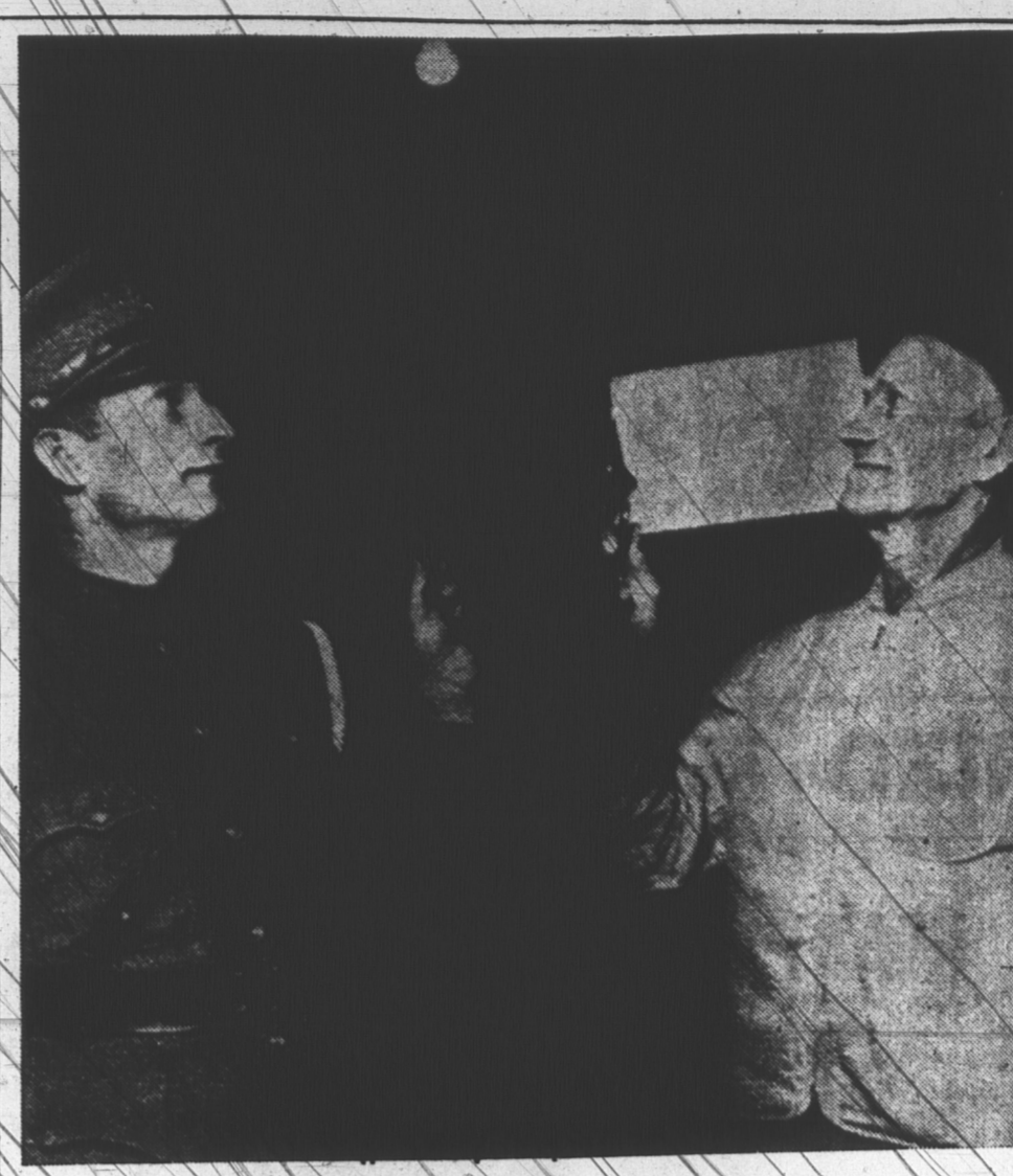
CHAMPION UNDER GUARD His owners are taking no chances with Bret Hanover, world's champion pacer before he races in Sunday's Autumn Classic at Blue Bonnets racetrack here. Racetrack police and trainers are keeping a 24-hour guard over the great harness horse until the $25,000 event.

The Saint Dunstan's University Saints are host this afternoon to the Acadia University Axemen. The Saints go into their game with a 1-2 win-loss record.