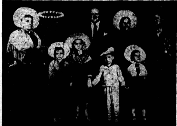
(Above) Mr. Richard Dimbleby, of the B.B.C., interviewed many Calais celebrities. He is seen here with a French family who took part in the programme.