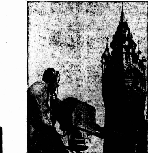
Cameras with one of the television cameras used during the broadcast, sited high above the ground facing the Clock Tower of the Hotel de Ville, Calais.