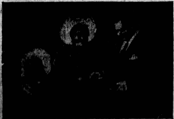
(Below) Some idea of the good reception enjoyed by British viewers is given by this picture of Richard Dimbleby talking to a member of the French family.