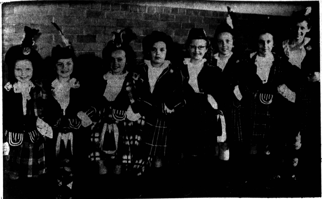
THE GLENGARRY DANCERS