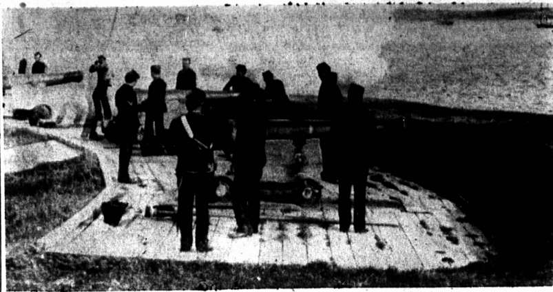
Firing Salute From Fort Edward 1900