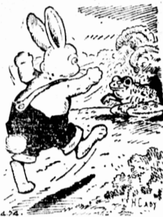
Going somewhere?" asked a voice behind him.

Old Mr. Toad had spent all winter and a little more buried in the earth in Farmer Brown's garden. He had been buried so deep that Jack Frost couldn't reach him. He had buried himself in the fall before even Jack Frost arrived. Now sweet Mistress Spring had awakened him and he had dug his way out just as he had dug his way in. He had spent a very comfortable winter, but he didn't know that you see he had been all the time in a strange deep sleep his-buried-not not once waking up. So of course all that time he knew nothing at all, whether comfortable or uncomfortable.