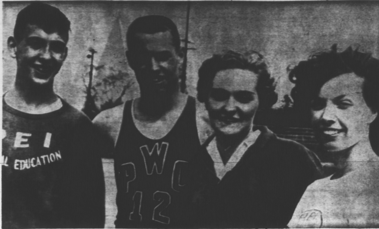
QUEENS COUNTY RECORD SETTERS