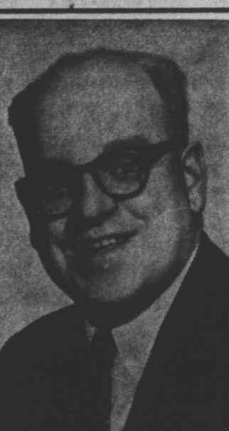
HEAR Mr. Heath Macquarrie M. P. With a Special Report from Parliament IIII Tonight over CF CY Radio 7:15