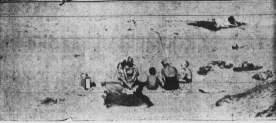
One of the many fine beaches on P.E.I.

To place your message in this Tourist Guide dial 4-8506 and ask for Display Advertising.