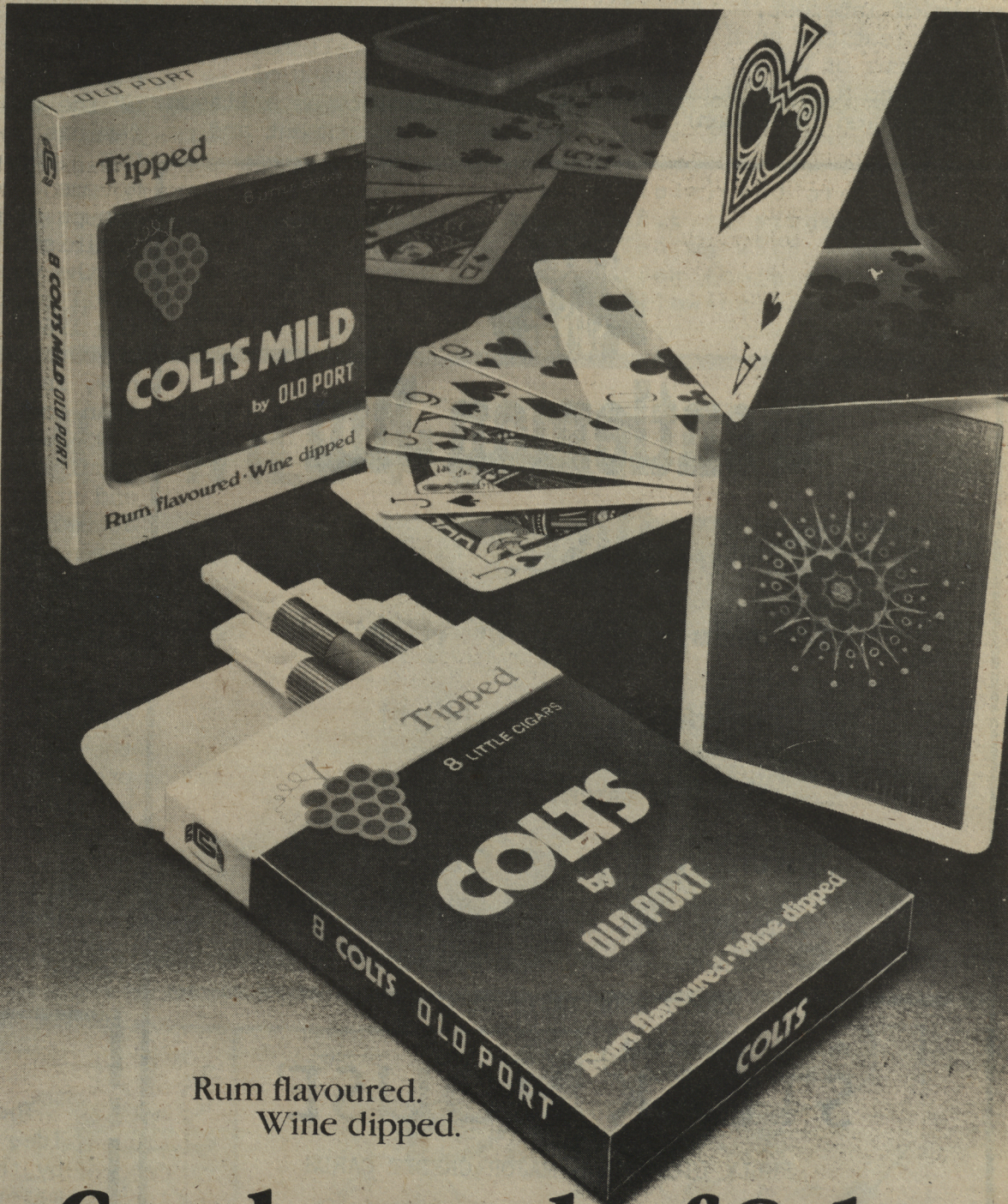
Rum flavoured. Wine dipped.

Crack a pack of Colts along with the cards.