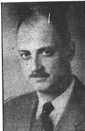
J. & T. MORRIS LIMITED.

Was born at New London, educated in public schools. Lobster packer for 22 years. Owner and Manager of the Montague Race Tracks which has held annual meets since 1909 and rated as one of the fastest tracks in the Maritime Provinces. Fox Rancher and farmer. Elected Mayor of Montague in 1937. Politics Conservative. Religion United Church of Canada. Residence, Montague.