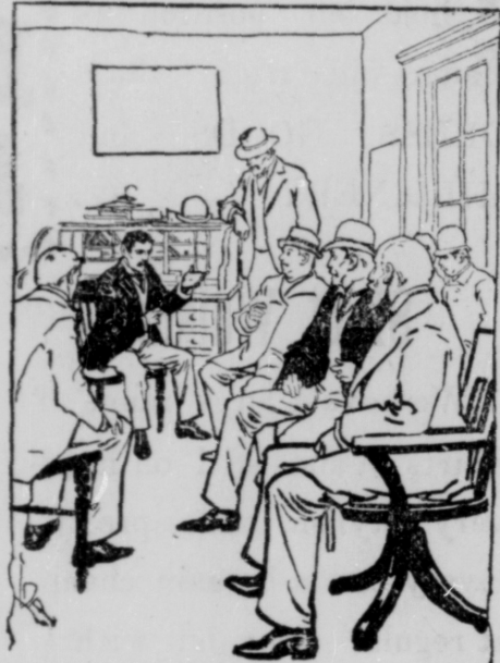
"I will ask you, Mr. Sheriff, to place Mr. Arnold under arrest."

Arnold nodded, and the professor went on: "To walk from the hotel to the boat, go back to the spot where the keys were lost, make the search for