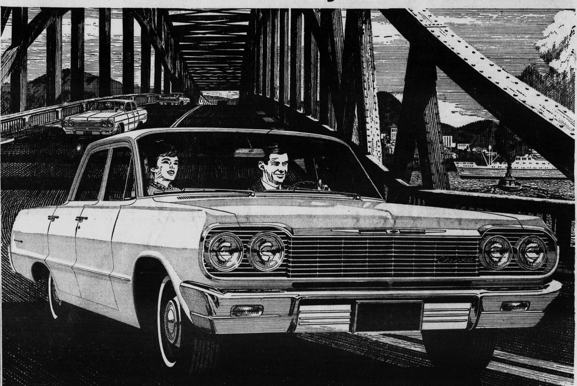
Biscayne 4-Door Sedan