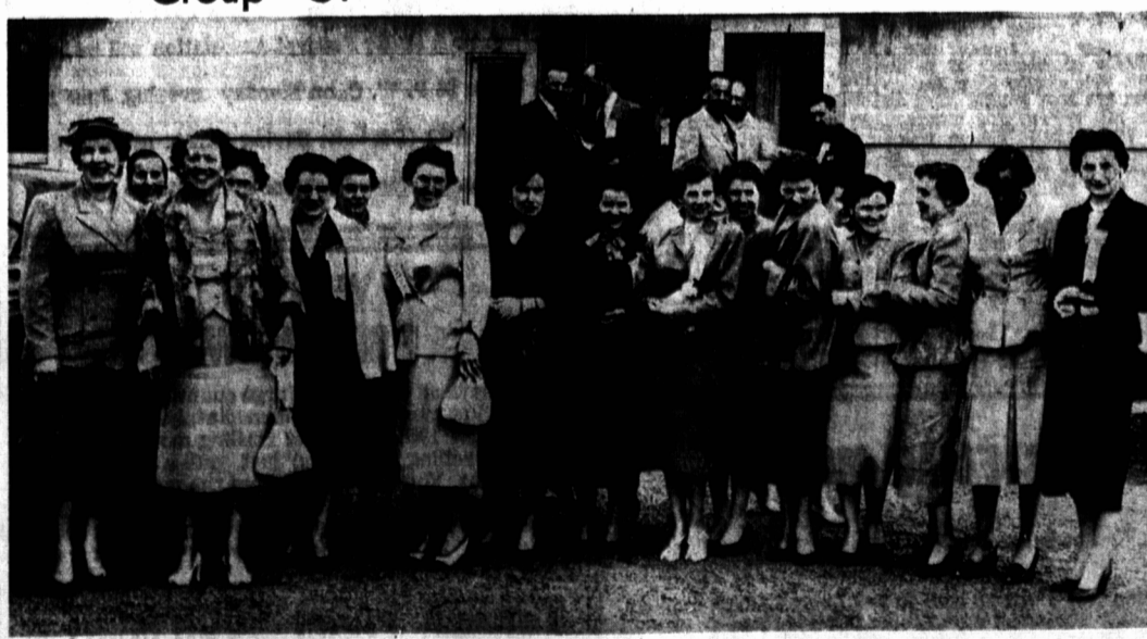
A group of Kinettes at Howard's Restaurant in Summerside, headquarters for the three-day annual convention of Kinsmen, are seen above yesterday afternoon before leaving in cars for Cavendish where they were entertained at dinner by the Summerside Kinettes. Upwards of 200 Kinsmen, wives and Kinettes, from 18 clubs in the four Atlantic Provinces, are registered at this district convention.