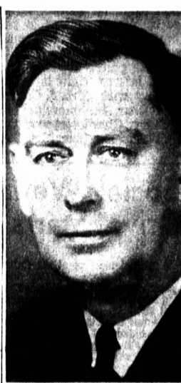
Happy Birthday! The Guardian joins in extending felicitations today to Premier A. W. Matheson on the occasion of his 52nd birthday anniversary.

DETROIT (AP)—The United Auto Workers (CIO) brought an end to the last of a dozen wildcat strikes at General Motors plants Friday and went back into contract talks with the company, openly expecting a new offer.