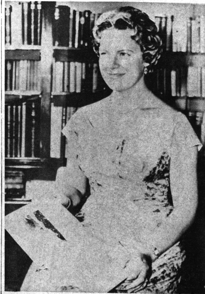
BIRTHDAY PORTRAIT This is Princess Irene of the Netherlands who was 19 years old Tuesday. She is second oldest daughter of Queen Juliana and Prince Bernhard. Recent official court picture was made in connection with birthday.

The heavy rain of July 29 caused a slight advance in late blight infection in those fields in which a trace amount of disease had already occurred, reports the weekly potato bulletin issued by the Science Service Laboratory at Charlottetown. Since then the air in most of the forecast area has been dry, arresting further spread. The disease situation will change but little so long as the present dry conditions prevail, but the next moist period will bring on a further advance. This advance should be offset by the application of a protective fungicide now. The warm, dry conditions, however, are favourable to the potato aphids and the populations of these insects are increasing. To control these, add Malathion to the spray mixture.