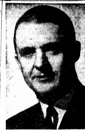
Finance Minister Abbott