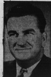
Hon. J. Angus MacLean