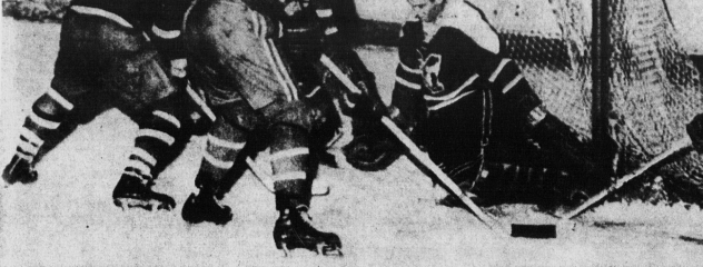
ALLAN CUP ACTION