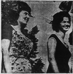
PRETTY GIRLS ADDED GLAMOUR