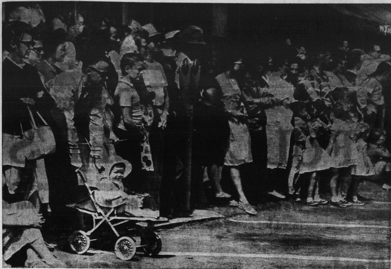
PART OF THE 22,000 PEOPLE WHO LINED CHARLOTTETOWN'S STREETS TO SEE PARADE IN 1962