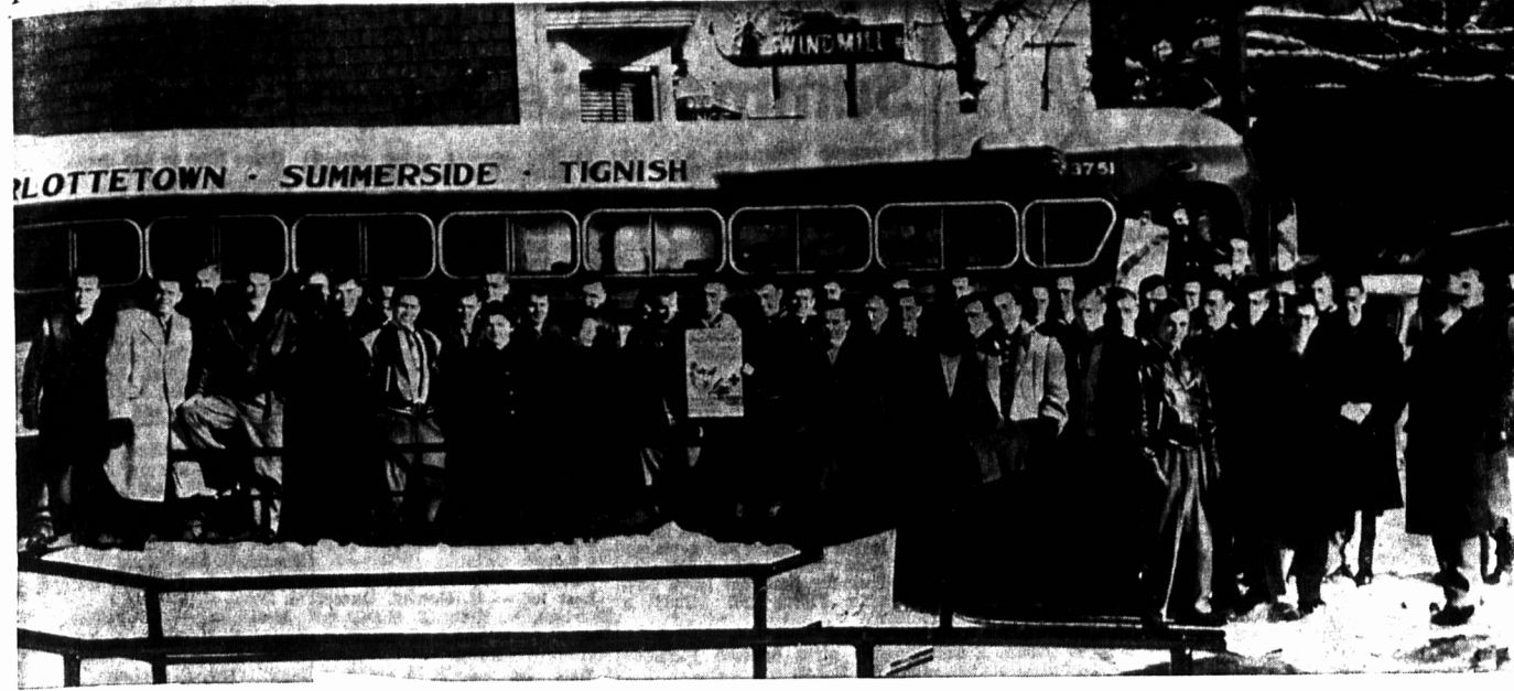
UNIVERSITY STUDENTS MAKE BLOOD BANK CONTRIBUTION