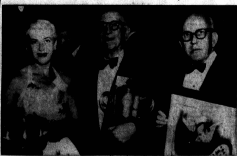
DRAMA AWARD WINNERS