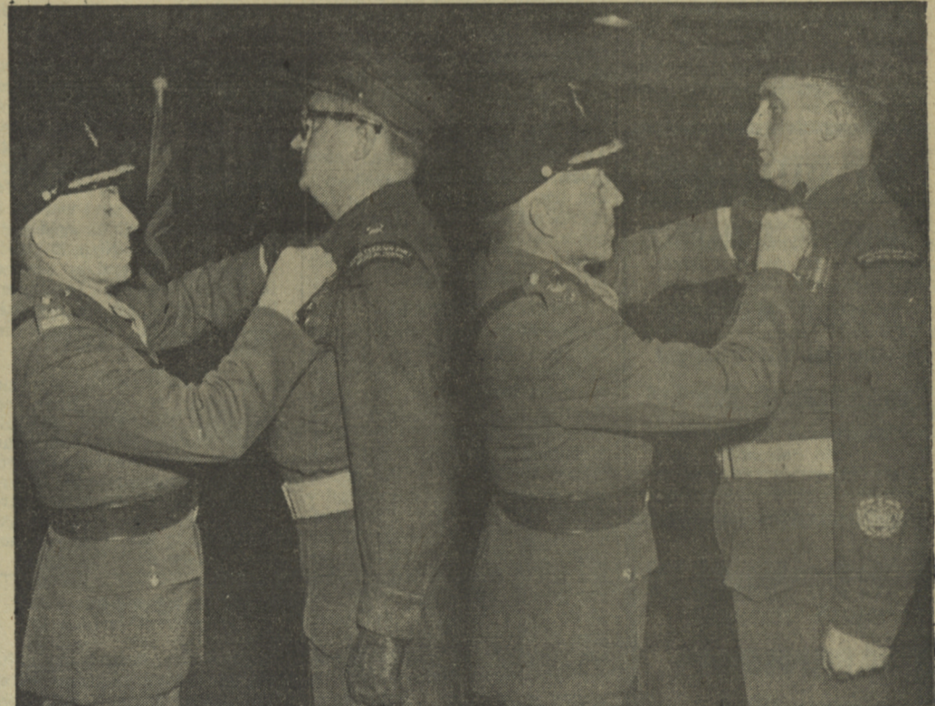
MEDICAL COMPANY MEMBERS DECORATED