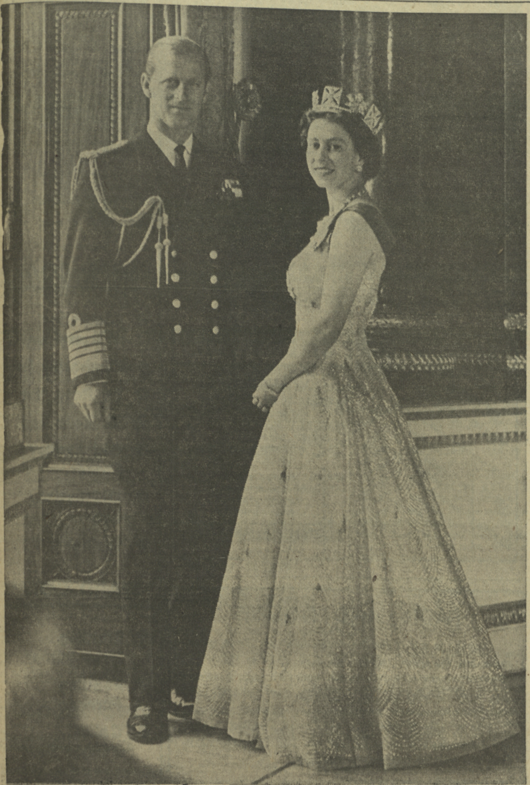
QUEEN ELIZABETH AND PRINCE PHILIP